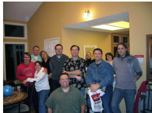
See what you missed?

I've been involved with AMC's for most of my life and like you I'm a diehard AMC fan. Over the years, I've made some really great friends and connections while being involved in the NTAMC club but there has been a lack of participation the last couple of years. I've been carefully reflecting on what we can do to make the club better for everyone. The answer is simple: getting YOU involved on a regular basis. Even more important than our AMC cars are the people behind them. It's really about family, friends and fun. We want to get everyone involved but we are going to place emphasis on car shows. We still have a core of racers and will support them as well. Please reconsider why you have your AMC, rejoin NTAMC, and AMO. Check out our website and get excited for your AMC again.